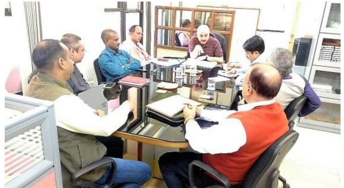
Board meeting (26 Jan 17)